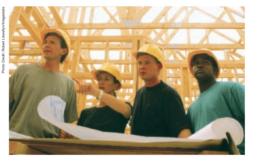
New Construction Businesses that build new buildings usually do so with borrowed money. What is the relationship between savings and loans?